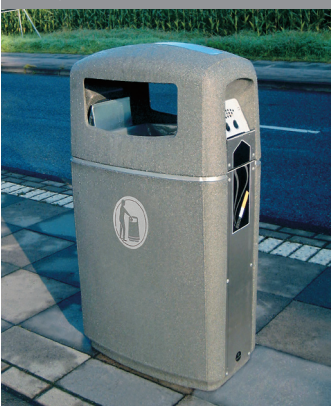
Stylish, purpose designed litter container with 2 integral ash containers.