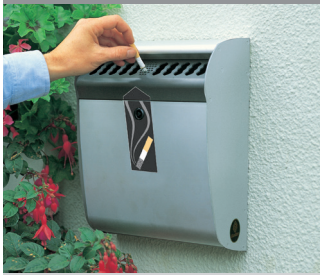
Heavy duty cigarette disposal unit for wall or glass mounting.