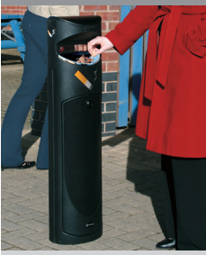
Contemporary styled, floor mounted cigarette container fitted with our unique Smokeguard system to contain smoke.