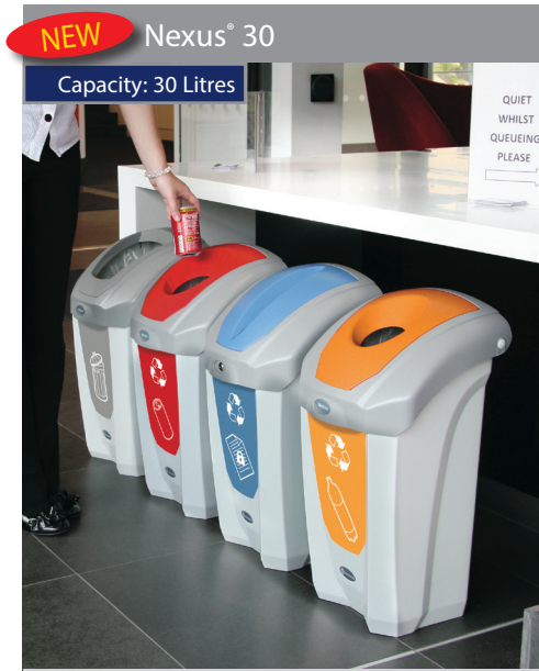
New Nexus 30 is a stylish solution for areas where space is limited.