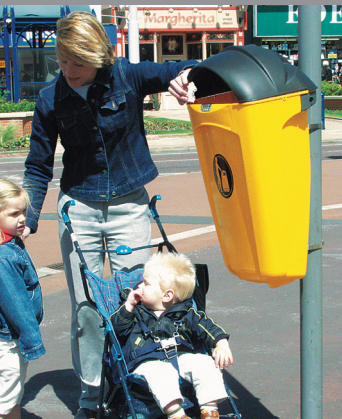
Super Trimline 50HSL can be either post or wall mounted.