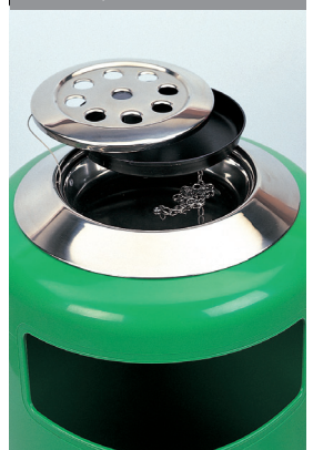
A large range of ashtrays are available for Glasdon litter/recycling containers.