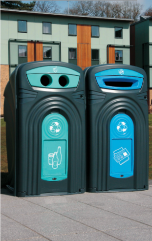
Nexus 360 is a unique recycling housing designed to accept a 240 litre or 360 litre wheeled container.