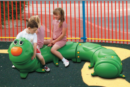
Munchy™ Caterpillar Seat

Munchy Seat is ideal for children's play areas.