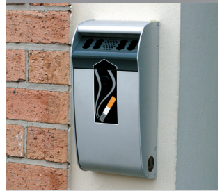
A slimline cigarette disposal unit manufactured from Vandalex.