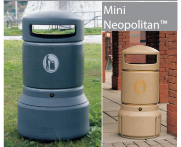
Neopolitan has a large 100 litre capacity and keyless locking system. Mini Neopolitan has a 63 litre capacity.