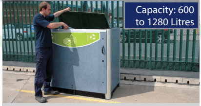
Visage is designed to screen 600L to 1280L capacity wheeled containers and provides an attractive appearance to unsightly bins.