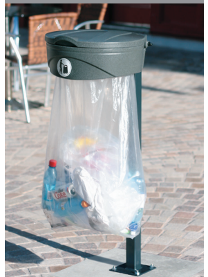
Contemporary styled circular sack holder, ideal for any environment.