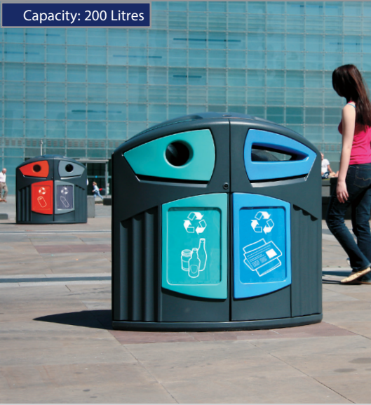
Nexus 200 is a contemporary styled twin-liner recycling bin, ideal for use in busy areas.