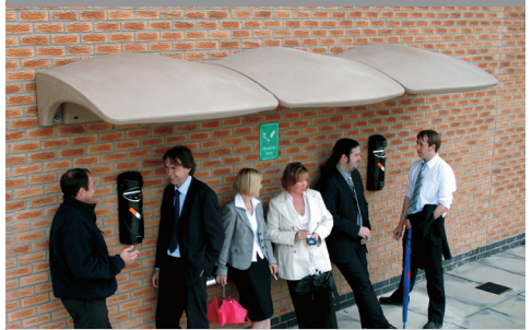
Durable and modern, Eclipse Canopy offers several fixing options; wall, post, side by side or back to back.