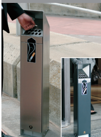
Floor mounted cigarette bin available in dark grey or stainless steel.