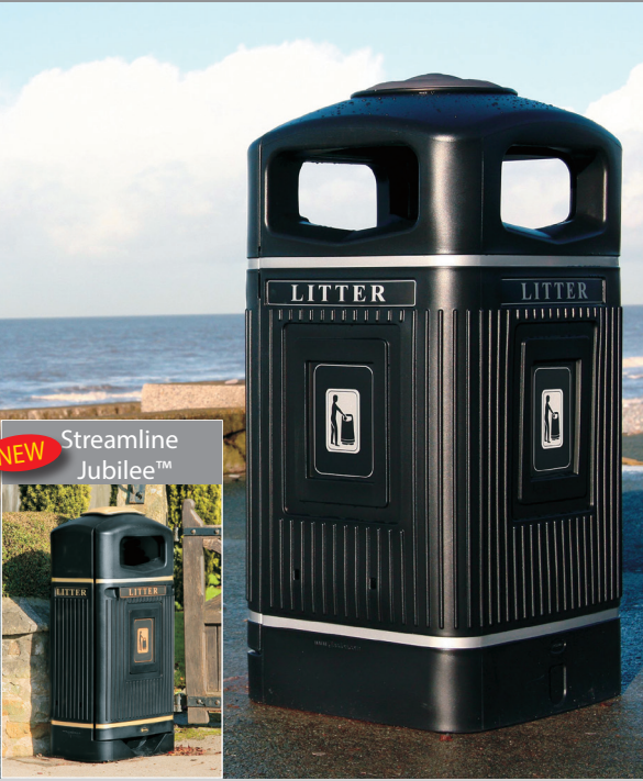
Glasdon Jubilee offers excellent anti-flyposting and anti-vandalism features.