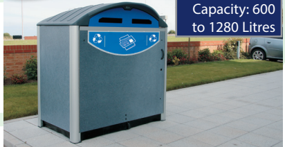
Modus housing is the perfect solution for maintaining the security and aesthetics of waste and recycling containers from 600L to 1280L.