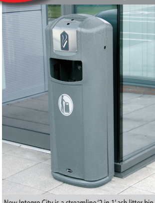
New Integro City is a streamline '2 in 1' ash litter bin which incorporates both an ash liner and waste liner in one stylish unit.