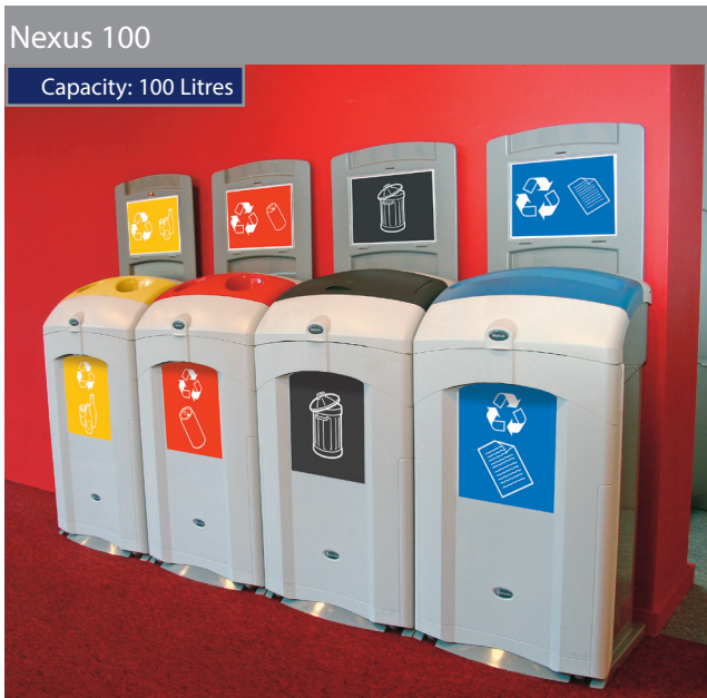
This large capacity recycling unit provides a stylish solution to enhance efficiency in office environments.