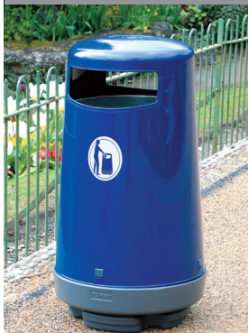
The stylish Topsy 2000 litter container is available with a keyless locking system or sturdy key-lock. Available in many colours.