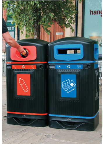
Glasdon Jubilee offers a stylish and practical solution for areas where a high volume of recyclable litter is created.