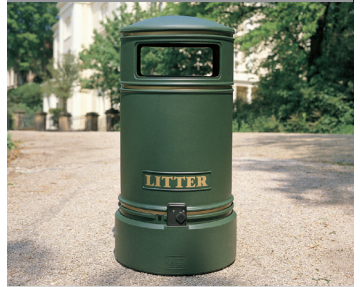
Topsy Jubilee is a Victorian-style litter container.