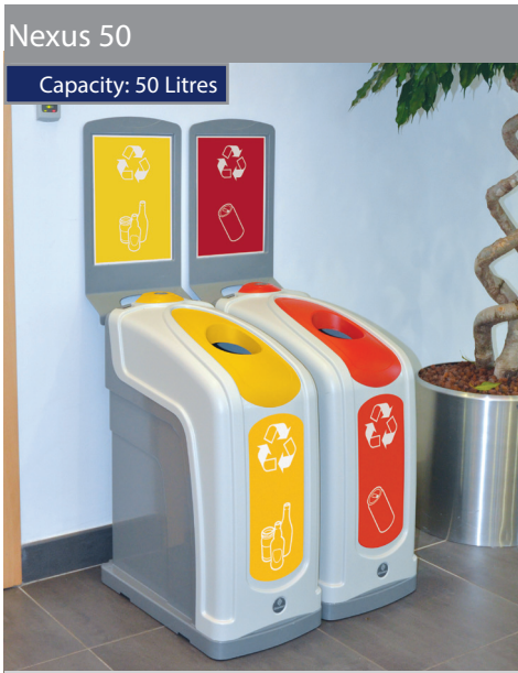
The sleek, contemporary design of Nexus 50 will complement any office.