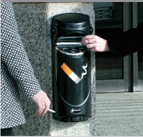
Wall/post or glass mounting cigarette bin fitted with Smokeguard™ smoke-dampening device.