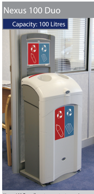
Nexus 100 Duo allows two waste streams in a single unit.