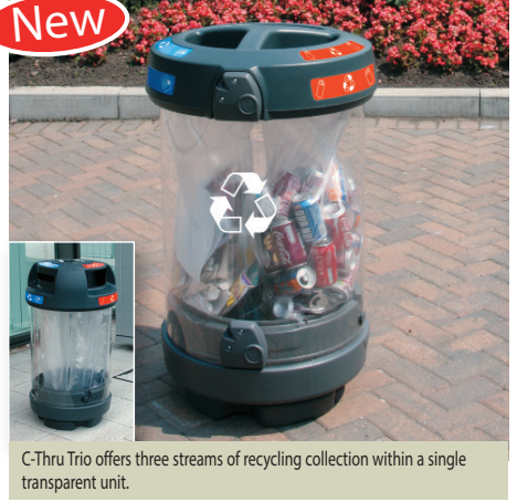
C-Thru Trio offers three streams of recycling collection within a single transparent unit.