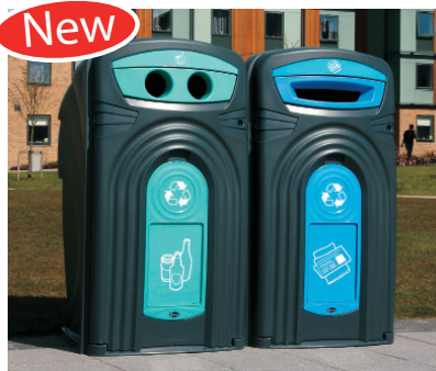
Nexus 360 Recycling Container is a new and unique recycling housing designed to accept a 240 litre or 360 litre wheeled container.