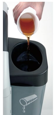
Side pod liquid reservoir collects waste liquid.