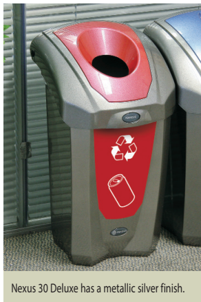
Nexus 30 Deluxe has a metallic silver finish.