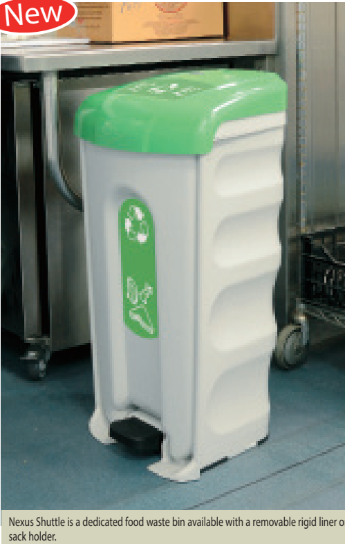
Nexus Shuttle is a dedicated food waste bin available with a removable rigid liner or sack holder.