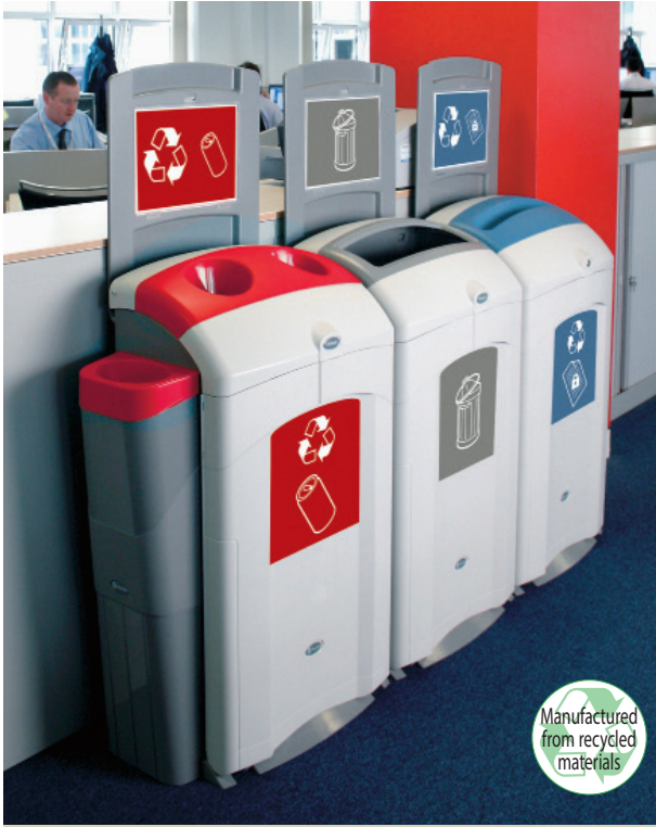
This large capacity recycling unit provides a stylish solution to enhance efficiency in office environments.