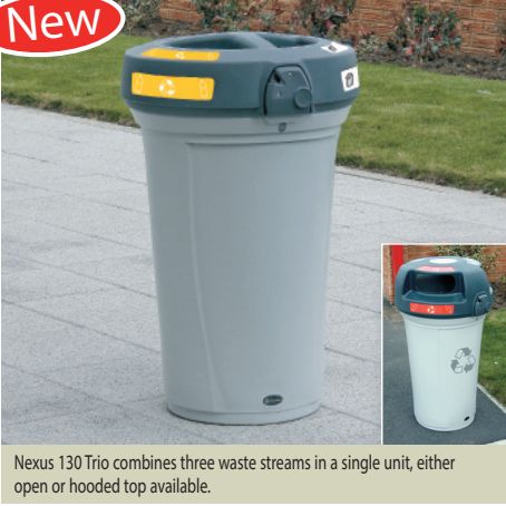
Nexus 130 Trio combines three waste streams in a single unit, either open or hooded top available.