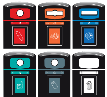
Aperture panels in bright colours make the units easily identifiable and help to prevent contamination of waste.