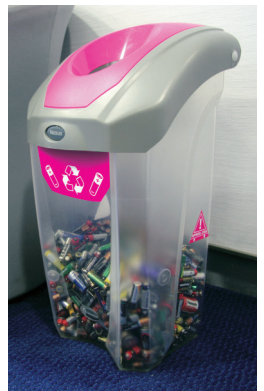
C-Thru Nexus 30 - ideal for collecting batteries.