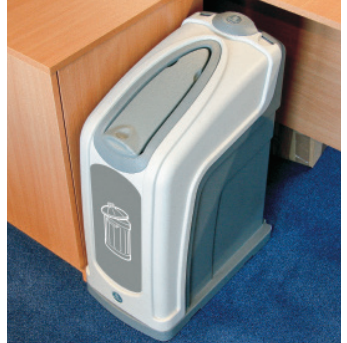
An optional general wasteflap contains any odours within the unit.