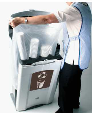
Four stacking tubes allow cups to be compactly collected within the unit.