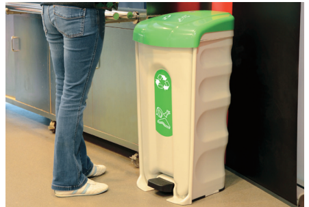
The foot pedal operated lid enables a hand free operation providing ease and speed of use.