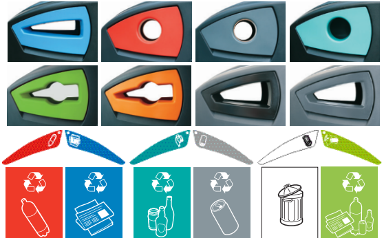
Aperture kits and signs for each waste stream reduce the risk of contamination.