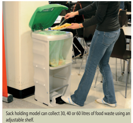
Sack holding model can collect 30, 40 or 60 litres of food waste using an adjustable shelf.