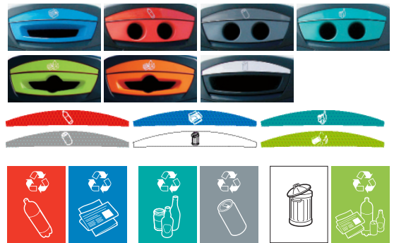
Aperture kits and signs for each waste stream reduce the risk of contamination.