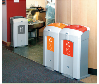
The slim compact design occupies minimal floor space.