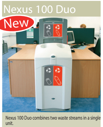
Nexus 100 Duo combines two waste streams in a single unit.