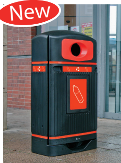
Streamline Jubilee has a narrow footprint.