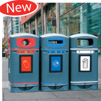
Glasdon Jubilee offers a stylish and practical solution for areas where a high volume of recyclable litter is created.