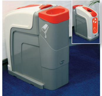
Nexus 50 is also available with a rear pod for the collection of small recyclable items such as bottle tops or waste liquid.