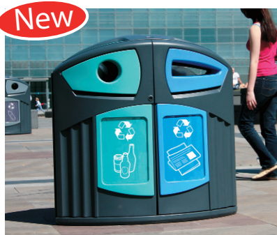
Nexus 200 is a contemporary styled twin-liner recycling bin, ideal for use in busy public areas.