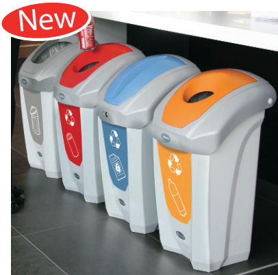
New Nexus 30 is a stylish solution for areas where space is limited.