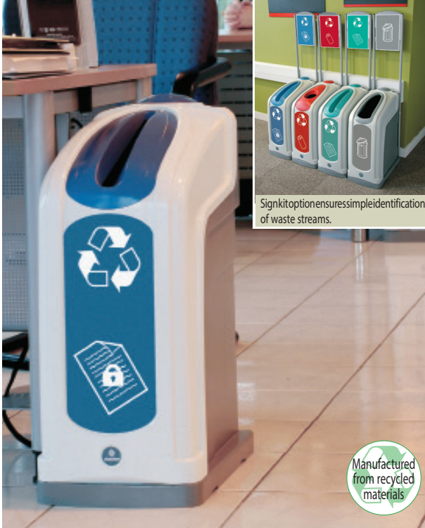
Signkit option ensures simple identification of waste streams.