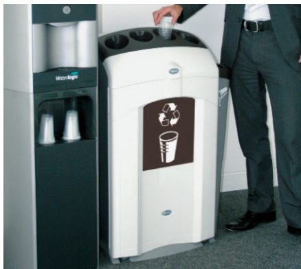
A highly attractive solution for the collection of used cups and waste liquid.